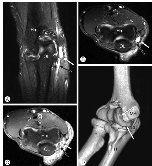
Fig. 1. Magnetic resonance imaging of ganglion cyst in the cubital tunnel syndrome. (A) T2-weighted coronal fat suppression image showing an irregularly lobulated cystic lesion (white arrow) abutting the ulnar nerve (black arrow) within the cubital tunnel. (B) T2-weighted axial fat suppression image showing the severely compressed ulnar nerve (black arrow) by a cystic lesion (white arrow). (C) T1-weighted, enhanced axial image showing a rim enhancement of the cyst within the cubital tunnel. (D) A three-dimensional computed tomographic image of the elbow joint showing marked degenerative osteophytes (arrows) in the ulnohumeral joint, indicating degenerative osteoarthritis. Hm: humerus; OL: olecranon; ME: medial epicondyle; R: radius; U: ulnar.

Ganglion cysts are benign lesions bound by dense connective tissue filled with gelatinous fluid rich in hyaluronic acid and mucopolysaccharides 2,12 . They are not lined by synovium, may be unilocular or multilocular, and often have internal septa 10 . They should be differentiated from synovial cysts. Synovial cysts are lined with pseudostratified columnar cells, whereas